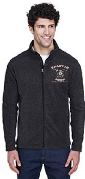
Fleece Jacket $60

S — 5XL Black, Burgundy, Gold, Purple, Navy, Red, Forest, Charcoal, Royal