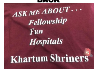
Fez Friday T-Shirt $30