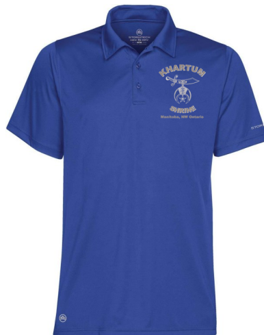
Performance Polo $45

S — 5XL Black, Burgundy, Gold, Purple, Navy, Red, Forest, Charcoal, Royal