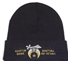
Shrine Toque $30

Gold, Charcoal, Safety Orange, Royal, Burgundy, White, Black, Pink, Red, Safety Green, Navy