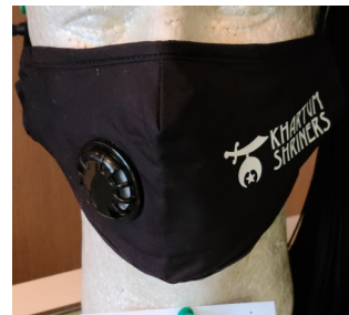
Khartum Shrine Mask $15

S — 5XL Black, Forest, Graphite, Kelly Green, Lilac, Navy, Orange, Royal, Yellow, White, Scarlet Red LADIES: Black, Graphite, Kelly Green, Navy, Orange, Royal, Scarlet Red, White