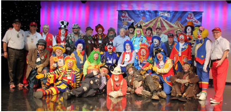
ISCA mid-winter-Komedians taking part with other clowns at the ISCA mid-winter