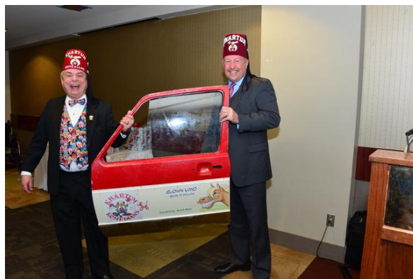
DSC 1251 - Look who won the door prize!!